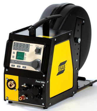
Origo™ Feed 3004