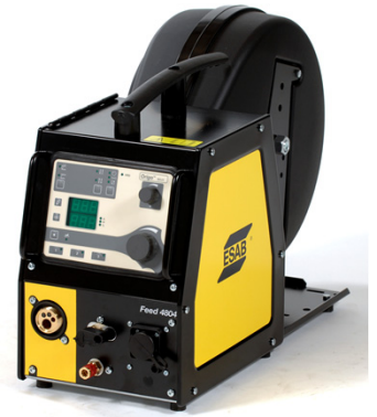
Origo™ Feed 4804