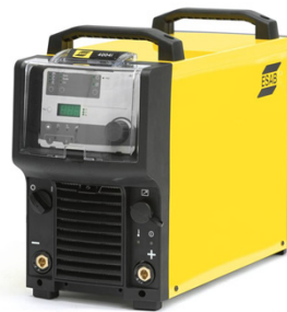
Origo™ Mig 4004i, A44

By choosing the MIG/MAG Arc Voltage Control setting you will achieve the best performance and avoiding arc out.