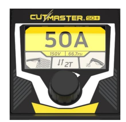
Simple and intuitive TFT LCD panel

Cutmaster 50+ is the perfect combination of power and portability for hand-held plasma cutting machines. Plus means more, so we've added a user-friendly 10.9 cm TFT LCD screen and upgraded features that give you even more control and flexibility to master any pierce and cut up to 16 mm. Together with the SL60 1Torch, it all adds up to the total plasma cutting package.