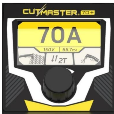
Simple and intuitive TFT LCD panel