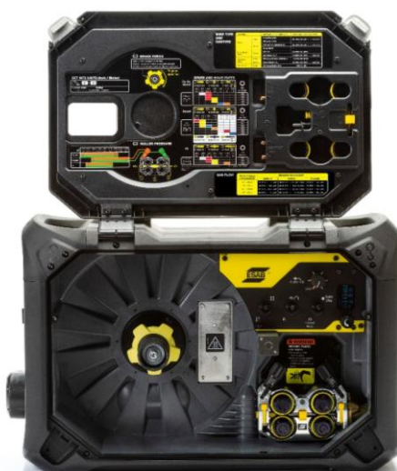
Internal LED lights and intergrated storage for wear parts in lid