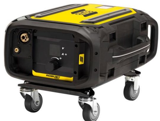
Wheel Kit works with feeder horizontal or vertical