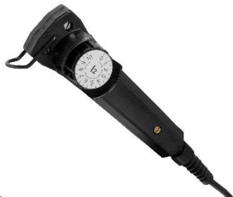
MMA 3 Traditional remote for amperage adjustment