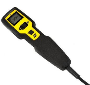
ER 1 Multi-functional remote with built-in display