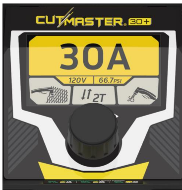
Simple and intuitive TFT LCD panel