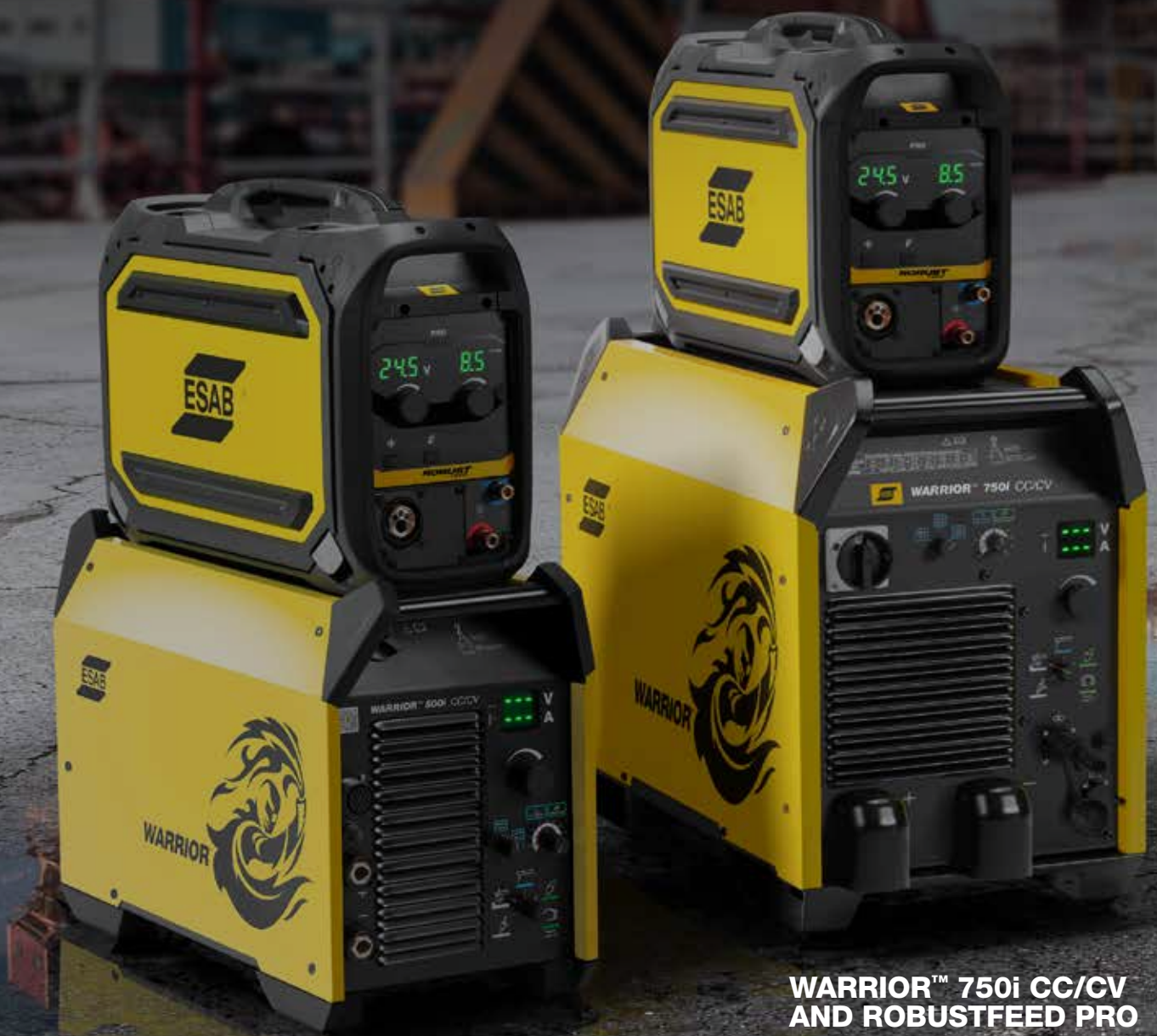
WARRIOR™ 500i AND ROBUSTFEED PRO

Simple to use – A clear and intuitive user interface with glove-friendly knobs makes setting adjustments quick and easy.