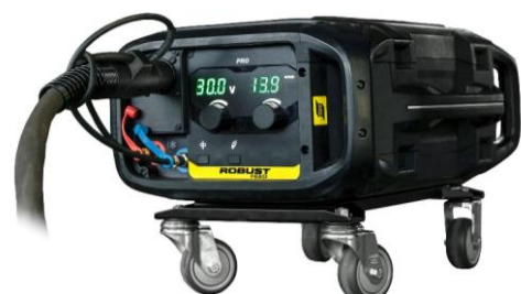
Wheel Kit works with feeder horizontal or vertical