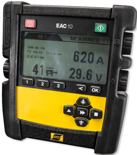
EAC 10 controller

The EAC 10 controller is designed to keep you in control of the welding. The controller has all the functionality needed for controlling a welding power source, welding head and the travel motion which makes it ideal for any light automation or tractor application.