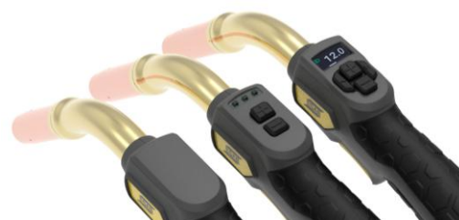
Exeor MIG 4.0G 2 , 4.0G 2 CX and 4.0G 2 DX Torches