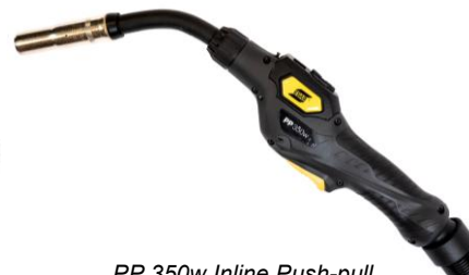
PP 350w Inline Push-pull