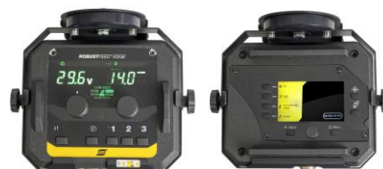
Remote User Interface